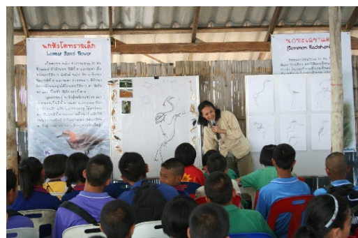
Fig 2: Mobile conservation education unit → conducting bird talk in school.