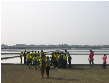
← Fig 1: Nature visit for the youth to get closer to the important wetlands (Photo credit: BCST).

A series of conservation education programme will be carried out by the Bird Conservation Society of Thailand around the Inner Gulf of Thailand, which is an important bird area for shorebirds in Thailand. Up to 35 bird species of globally conservation concern can be found during the migration season or wintering at the project site, including Asian Dowitcher Limnodromus semipalmatus , Brown-headed Gull Larus brunnicephalus and Spoon-billed Sandpiper Eurynorhynchus pygmaeus . The project aims at raising public awareness of bird conservation, the concept of Important Bird Areas (IBA), the importance of wetlands conservation and sustainable utilisation of wetland resources among all stakeholders. The targeted audience will include local communities, local youth and local schools in and around the communities in the Inner Gulf of Thailand. Through organising workshops, nature visits and mobile conservation education at schools together with the production of awareness materials, it is expected that 10,000 local people can receive information on wetlands and birds. The project duration will last for 1 year.